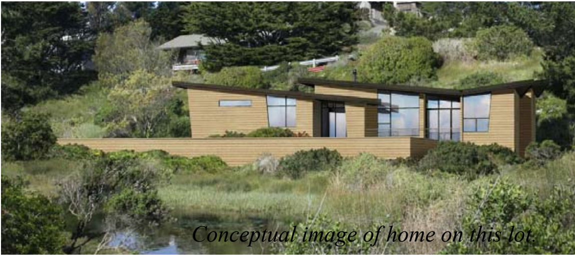
Conceptual image of home on this lot.