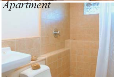
Lower Level Apartment

See upper level home on first page of this flyer.