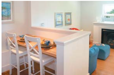
Lower Level Apartment